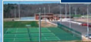
Bryant Sports Complex

Installation Design Build Repairs 24 Hour Emergency Service