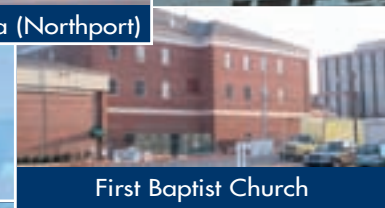
First Baptist Church