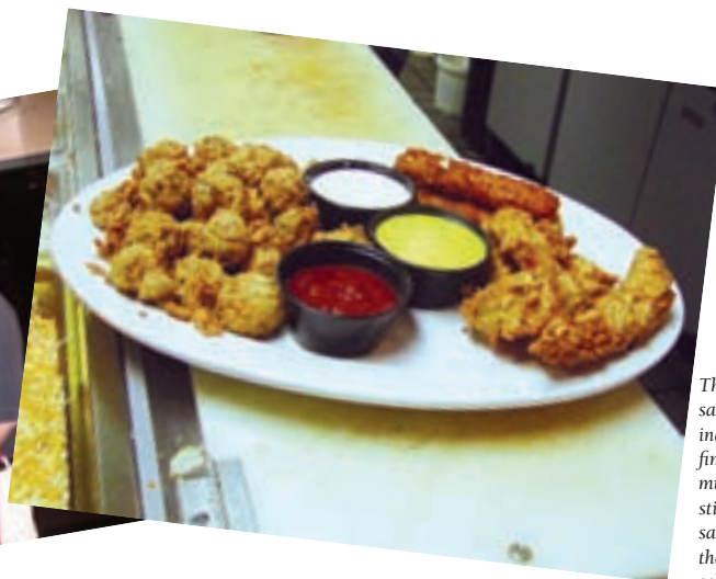
The appetizer sampler which includes, chicken fingers, fried mushrooms, cheese sticks and dipping sauces is one of the most popular selections.

As Jupiter is the biggest planet in the galaxy, Jupiter Bar and Grill will remain the biggest venue in Tuscaloosa if they keep spicing up their entertainment agenda with new ideas and popular performers and continue to serve “out of this world” food.