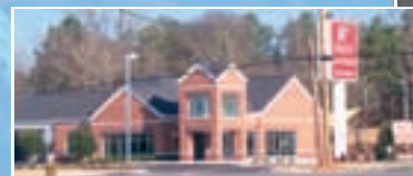
Bank Of Tuscaloosa (Northport)

Commercial Industrial Residential Sales Service