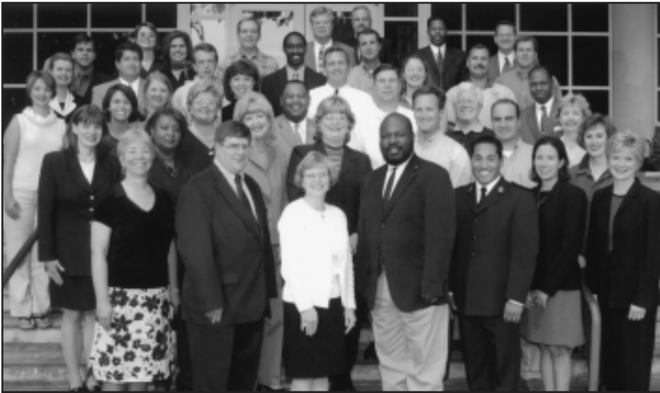
The 2002-2003 class of Leadership Tuscaloosa graduated on May 15th.

On May 15th, the 2002-2003 class of Leadership Tuscaloosa graduated in ceremonies at the Four Points Sheraton Hotel. Forty-two outstanding citizens completed the nine-month leadership development program, sponsored by The Chamber of Commerce of West Alabama and the College of Continuing Studies at The University of Alabama.