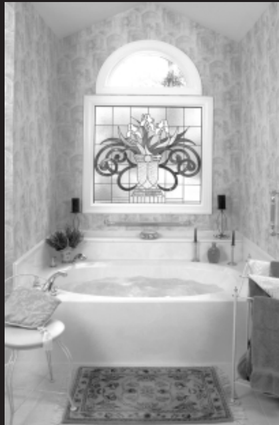
Custom home at Lexington Downs

cus•tom (‘kus-təm) adj : made or performed according to individual order.