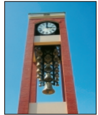
Shelton State Community College's new Clock Tower