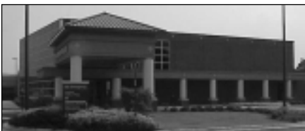
Award winning construction project: Women's Pavilion at Northport Medical Center.

We are proud to recognize Premier Service Company as our 2002 state-wide honoree for electrical projects at the Women's Pavilion at Northport Medical Center. Premier is the only local business in West Alabama to have ever been recognized with this award.