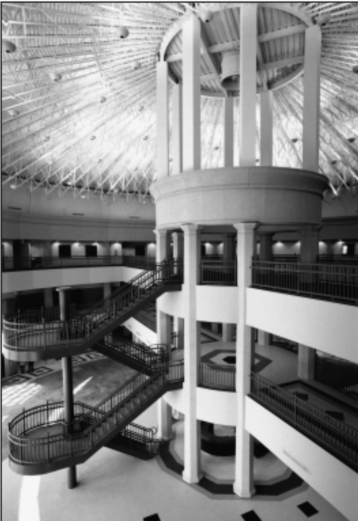
Shelton State Community College will be the home of the new Center for Workforce Development of West Alabama.